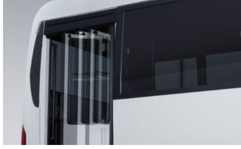
Rear Reflectors Chrome Tailgate Garnish Rear Automatic Swing Door