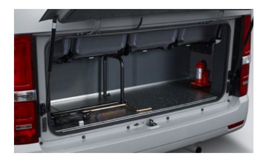
Aerodynamic Rear Roof Spoiler Micro-Antenna Rear Luggage Compartment