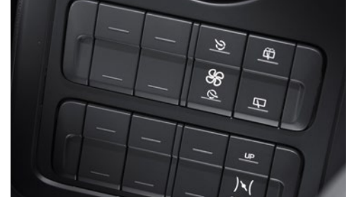
Stylish Wheel Covers M400 Audio System Easy-to-Operate Driver Side Switch Component