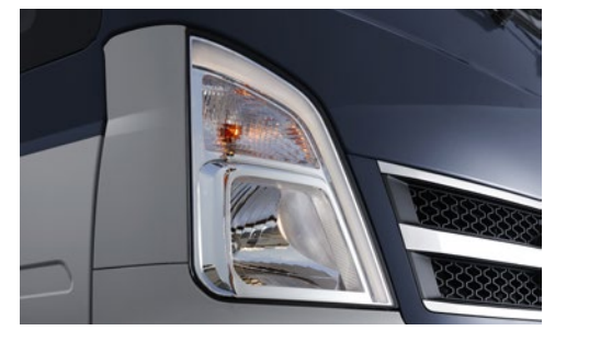
Accru Beige (PAH) Lemmon Yellow (WEY) Blue + Magnetic Grey (RBB)