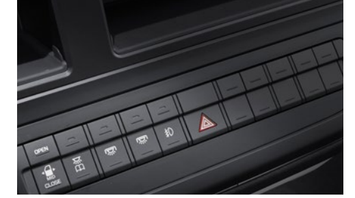
Power Steering Digital Tachograph Horizontal Layouted Center Switch Pannel