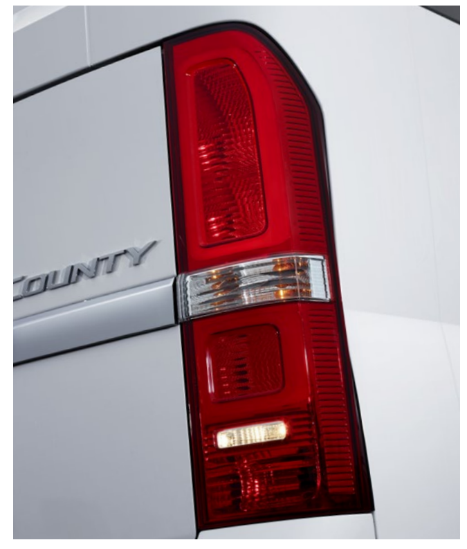
Vertical Rear Combination Lamps Standing tall and proud, the new vertical-style tail lights provide maximum visibility and allow the enlargement of the cargo flap door to improve access to the luggage space.

Extra large-size mirrors offer excellent coverage of the side and front corner areas for improved safety while the chrome finish adds a luxurious touch. Electric adjust and heating function add more drivers' convenience.