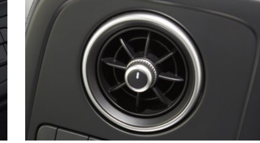
Tilt-Adjustable and Telescopic Steering Ignition Key Hole Illumination Circular-type Adjustable Air Vents