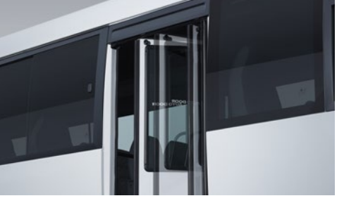
Front Projection Fog Lamps Matte Black Rear Pillar Garnish Auto-Folding Mid Swing Door