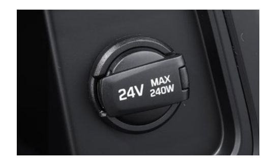
Steel Wheels M800 Audio System 24V Power Outlets